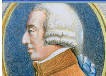
Adam Smith 1723–1790

In his book The Wealth of Nations , Smith argued that if individuals freely followed their own self-interest, the world would be an orderly and progressive place. Social harmony would result without any government direction, "as if by an invisible hand."